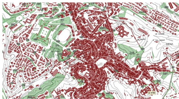
Figura 39 Estratto della mappa interattiva del verde urbano nel Comune di Siena