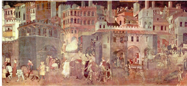
Figura 1 Particolare del ciclo di affreschi "Allegoria ed effetti del Buono e del Cattivo Governo" di Ambrogio Lorenzetti (1338-1339), Palazzo Pubblico a Siena.

May 12 to June 4, SU 2026 -- in Siena, Italy